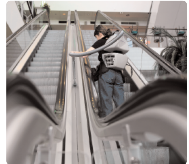
The battery version gives the operator total freedom and the possibility to clean hard-to-navigate areas