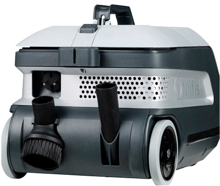
User friendly and easy to reach accessories