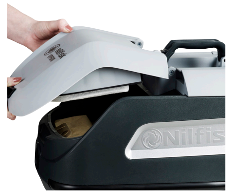
Magnetic hinges securing high reliability