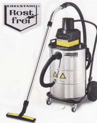
NT 80/1 B1 M